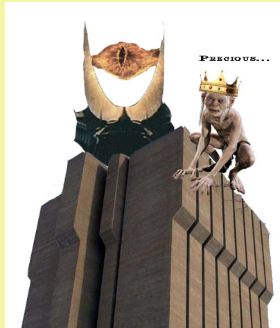
Seems the MEEM shall be the kings new residence...

Michigan Tech Homecoming has been brought to a screeching halt as of Thursday night where it was formally announced that campus had been overrun with Uruk-hai and that all should bow before the Dark Lord via email, as required by federal law. This follows after a series of battles in the underground steam tunnels all over campus and midnight raids in the Tech Trails.