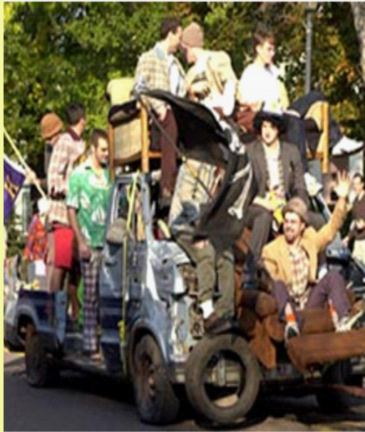
Hobo Parade. Now with 40% less hobo.

So let's show these freshmen what Homecoming has to offer, it's time to bring HOB0 back!!!